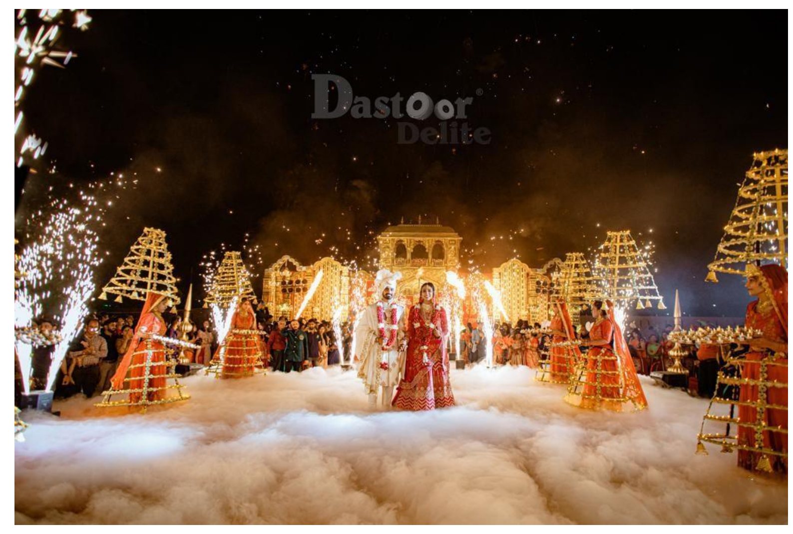
Grand Sangeet / Cocktail Truss Stage