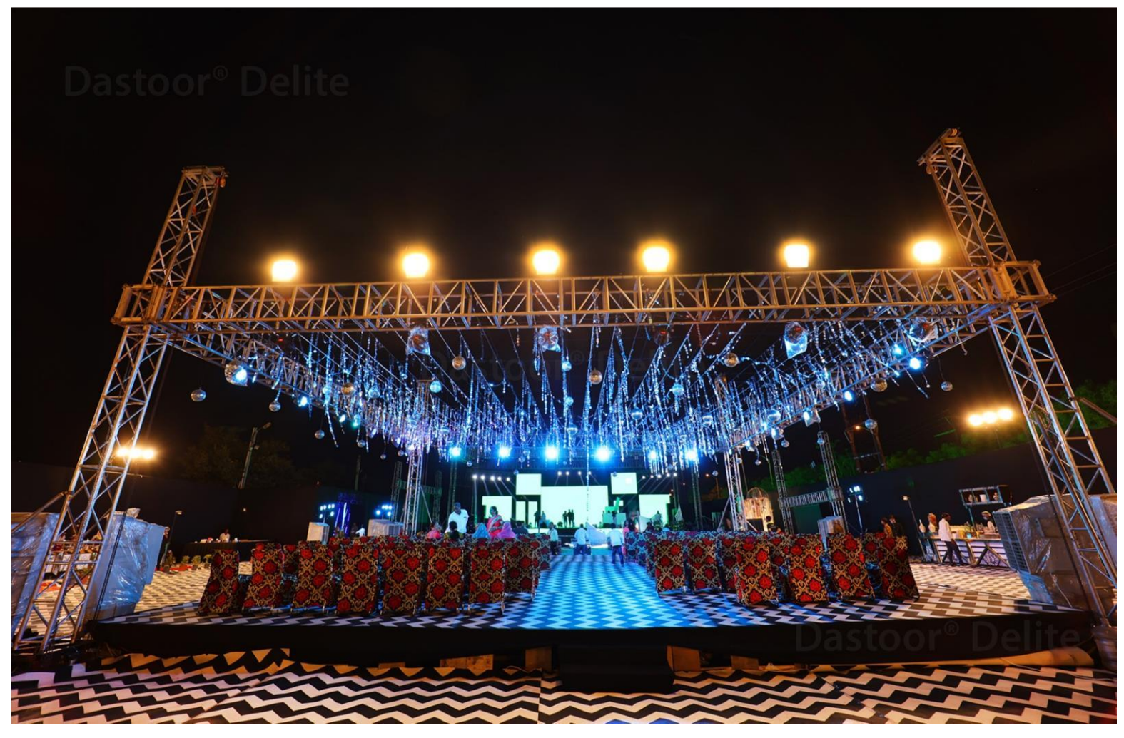
Royal Baraat Entrance