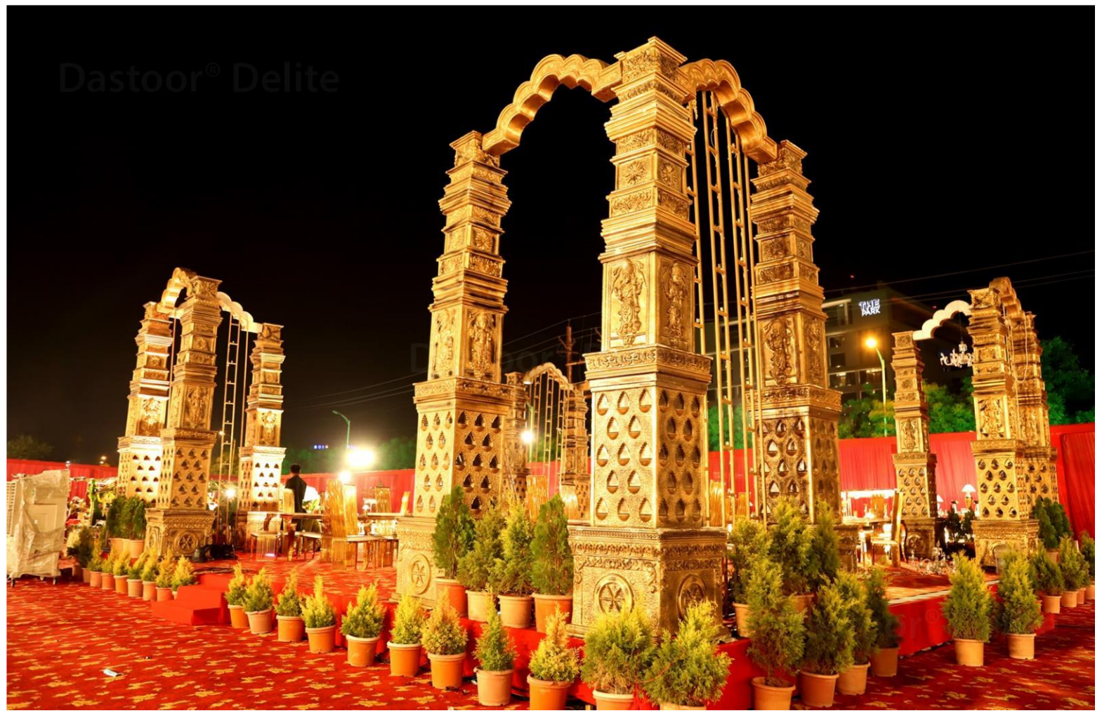
The Grand Reception